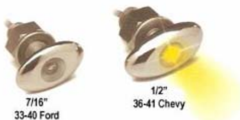
7/16" 33-40 Ford