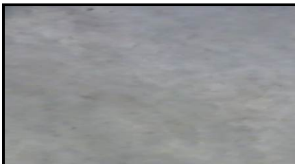
Buck Guthrie's ??????????????