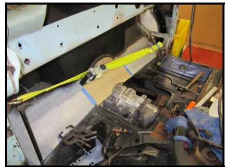
Mike Connor's 1956 F-100 Panel