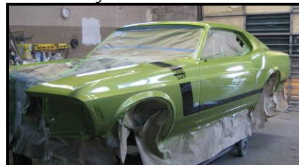
Bill Watkins' 1969 Mustang