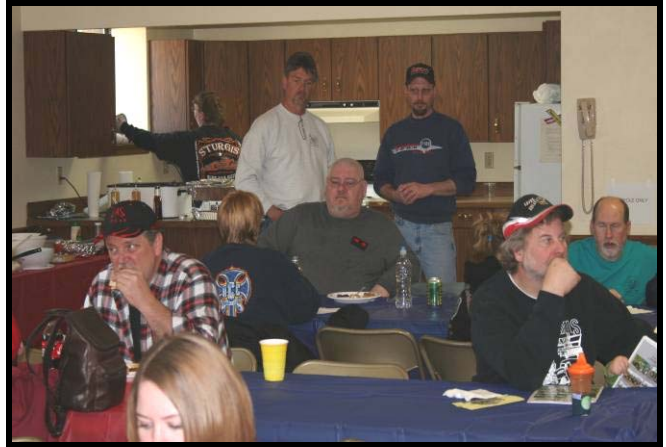
It's quiet-they're all eating.