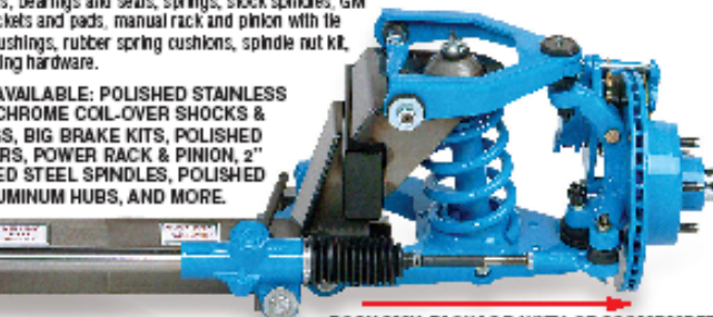
ECONOMY PACKAGE WITH CROSSMEMBER