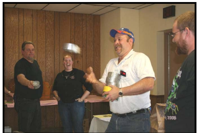
"I only need duct tape to finish my Unibody"