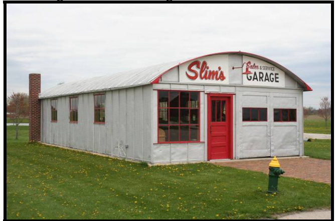
Slim's Garage – Slim was on vacation.