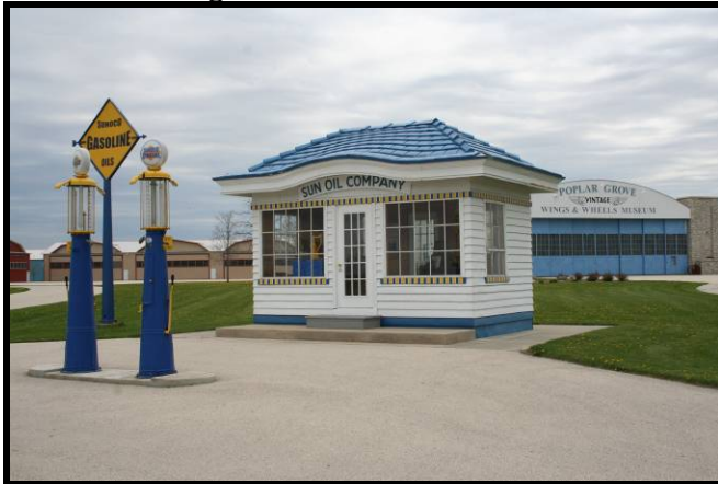
Old time Sun Oil Gas station.