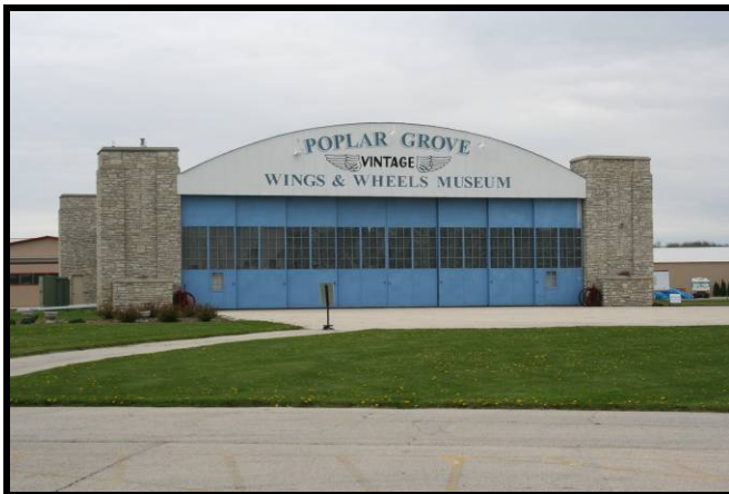
Museum hangar moved from Waukesha, WI