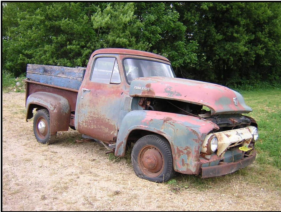
Well used but barn fresh 1954 F-100.