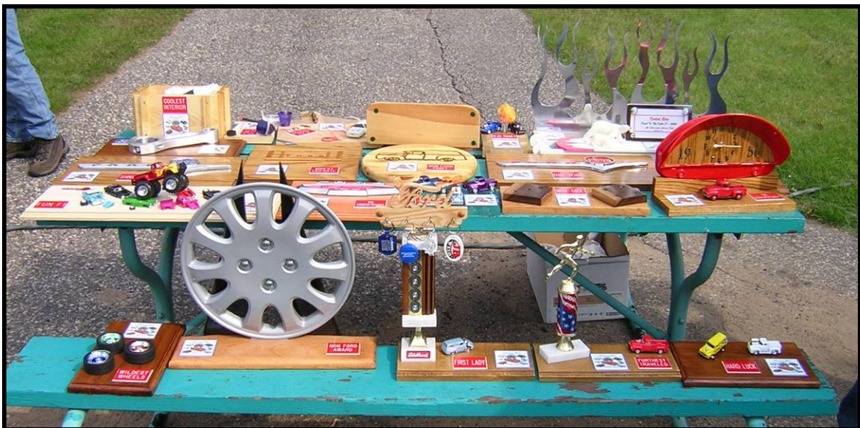
Trophies from a few years past.

Highest Mileage Non Ford Award Just Finished All Nighter (stayed up all night to finish) Kids Choice Licensed To Thrill (best plate) Ladies Choice Long Distance Loudest Pipes Lowest Truck Most Vibrant Most Colorful Most Unique Horn Most Unique Wheels Most Cubes (largest cubic inch displacement) Most Louvers Most Gadgets Most Tolerant Wife Narrowest Rear End Neatest Artwork Neatest Wiring Oldest Truck Oldest Trucker Phantom Ford (registered but no truck) Participants Choice Poker Run