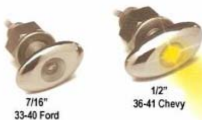
7/16" 33-40 Ford