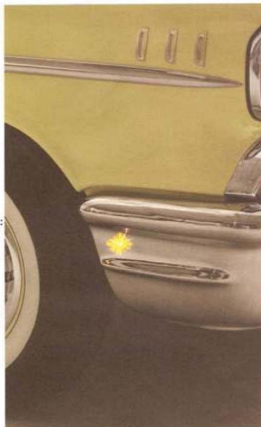
1/2" 36-41 Chevy