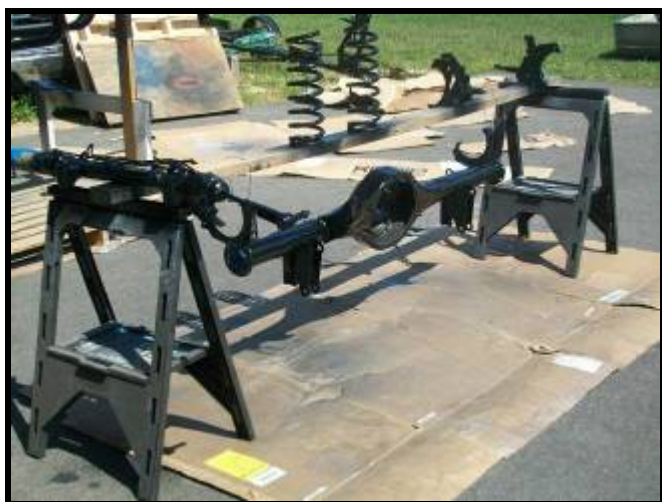
Greg Schneider painted all the parts and the frame.