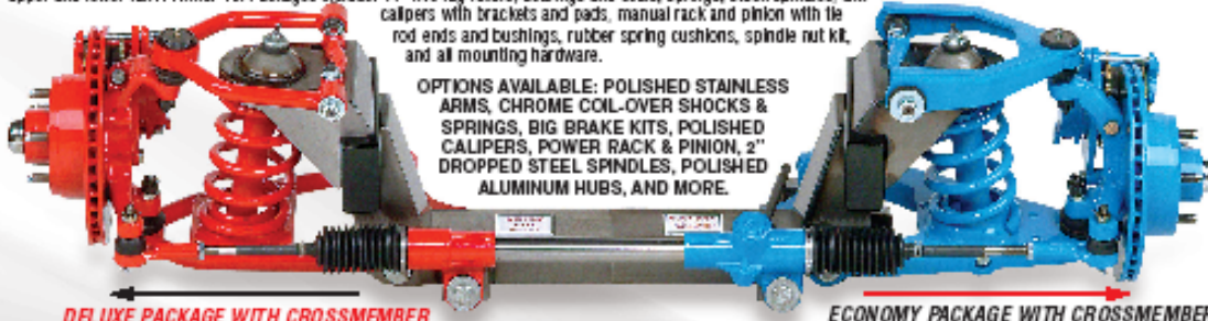
DELUXE PACKAGE WITH CROSSMEMBER