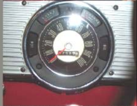
ABOVE: With the exception of the radio, the interior is as it came from Ford.