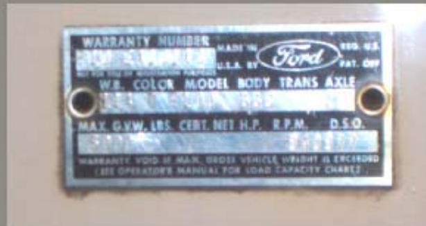
ABOVE: The cert. net h.p. rating was left blank on the door tag from the factory.