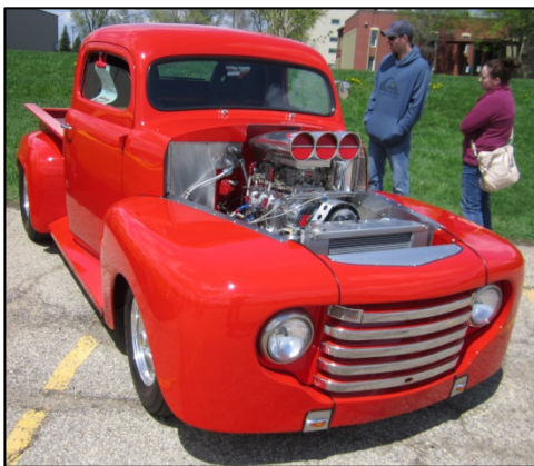
Nice F1 street/race machine.