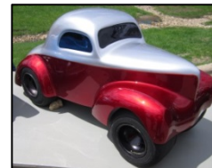
Small scale cars painted by Mitch Lanzini & Nubby.