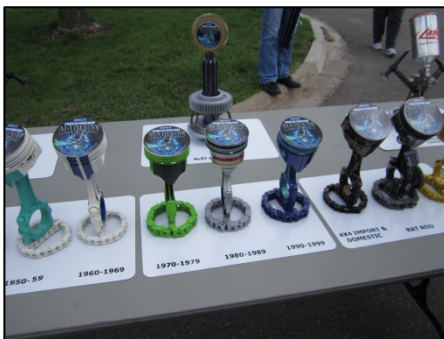
MATC student made trophies.