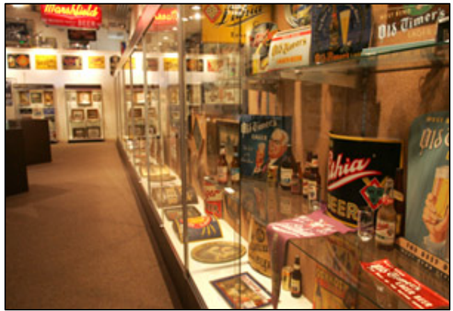
Inside the Potosi Brewery Museum.