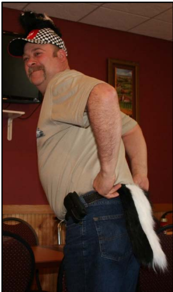
What did I make a stink about?