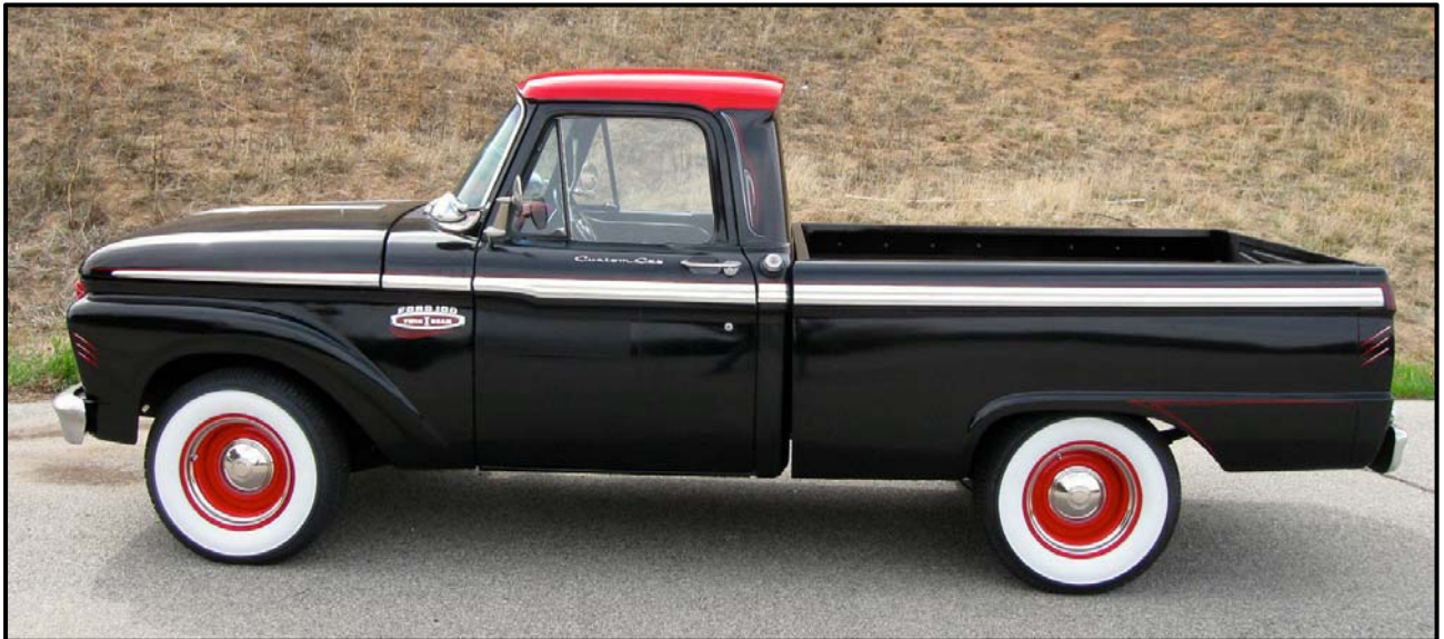
A nice example of "Slick 60's".