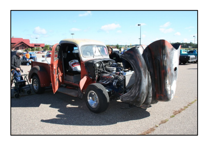
Chuck & Marlene Rogers' cool 1946 Ford truck.