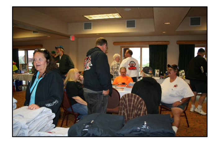
Friday morning registration.