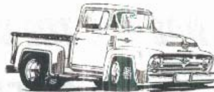
1948-1972 Ford F-100 Truck Show