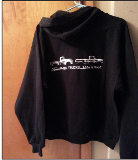
Ford F-100 TRUCKS....Life is Good Zip Up Hoodie (art on backside) $30 Size L (Navy) Size XL or 2XL Black