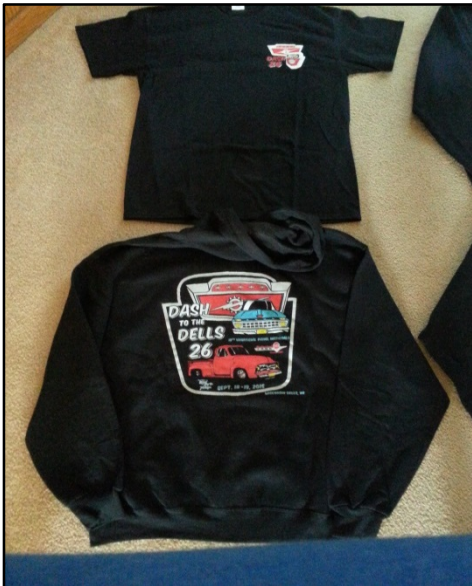
Crew Sweatshirt-No Hood (art on front) $20 Size XL Black