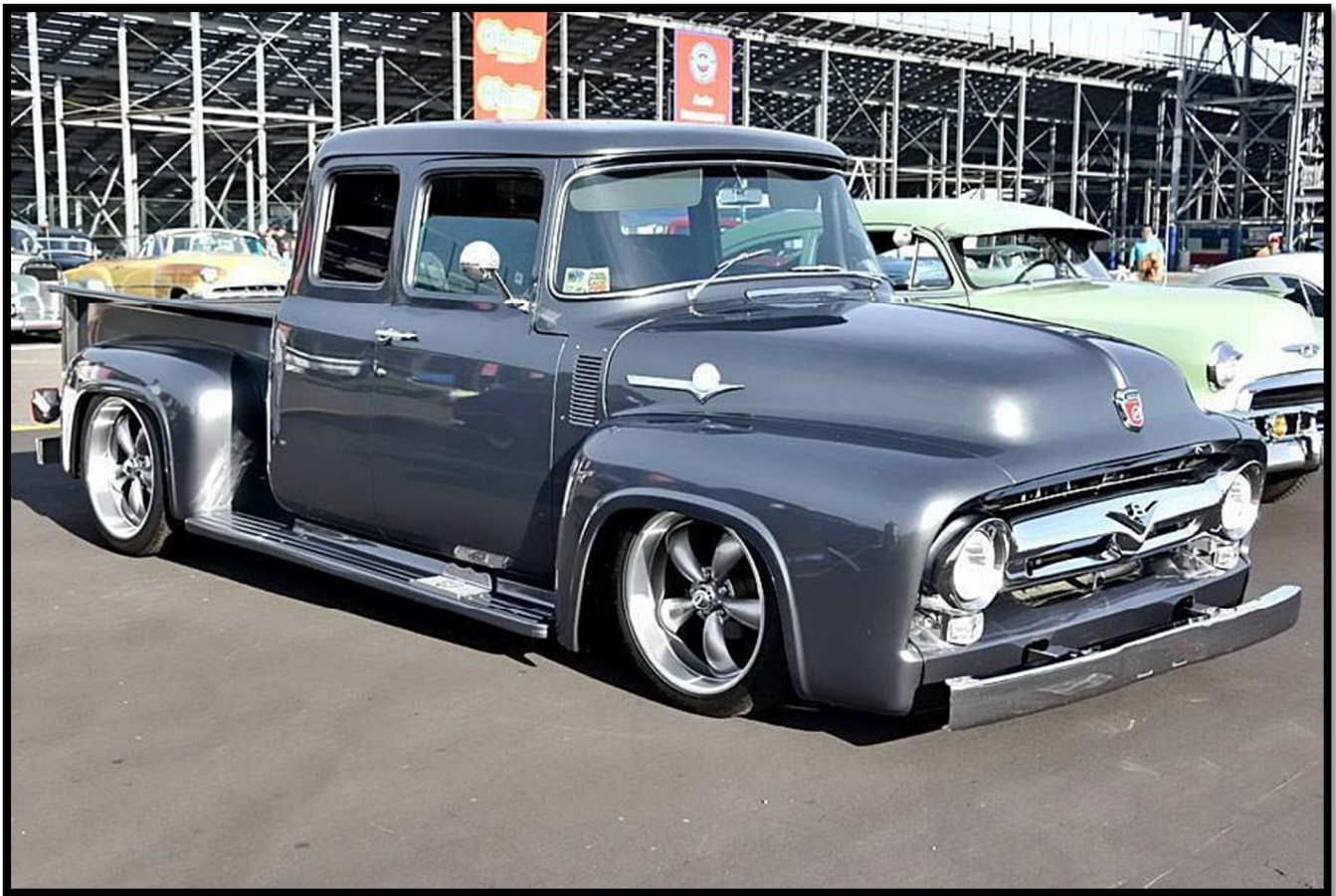
Nice 1956 F100 X-cab