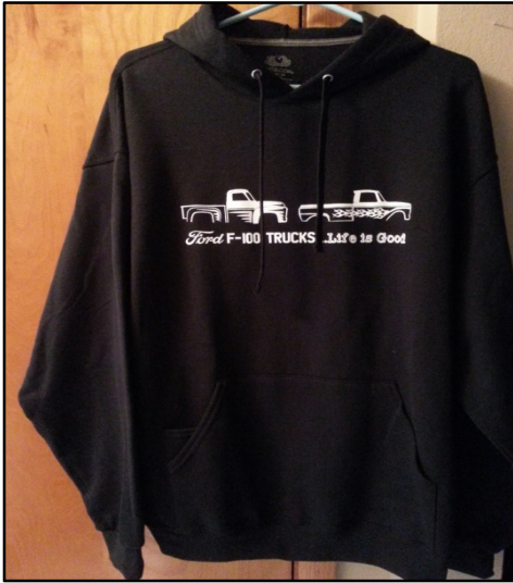
Ford F-100 TRUCKS....Life is Good Pullover Hoodie (art on front) $25 Size XL Black