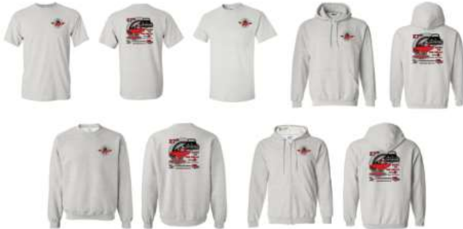
DASH 27 LOGO