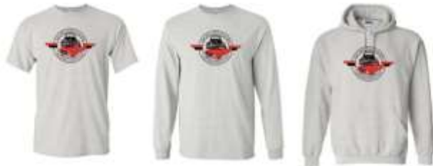
1956-1966 ANNIVERSARY LOGO

Zip Hoodie $30 : Kid's Med, Adult M, L, XL, 2XL, 3XL