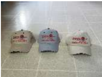
Hats - $15

We still have a few items left from the show in case you are interested.