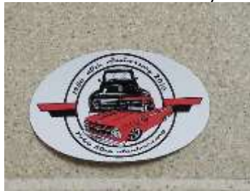
Stickers – 2 for $1.00

Dash 26 black Short Sleeve T-shirts - Large - $7,