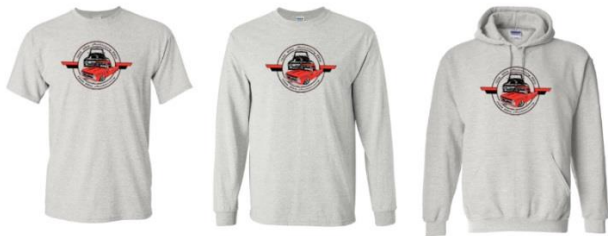
1956-1966 ANNIVERSARY LOGO