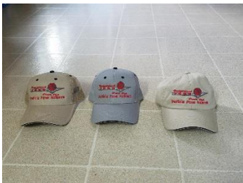
Hats - $15

We still have a few items left from the show in case you are interested.