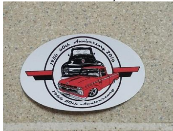
Stickers - 2 for $1.00

Dash 26 black Short Sleeve T-shirts - Large - $7,