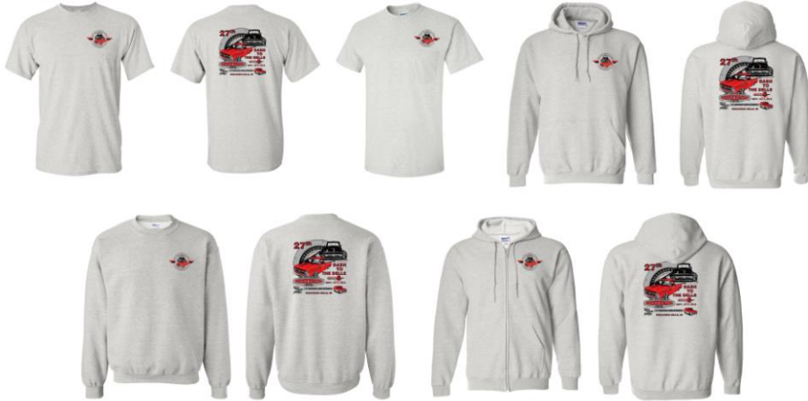
DASH 27 LOGO