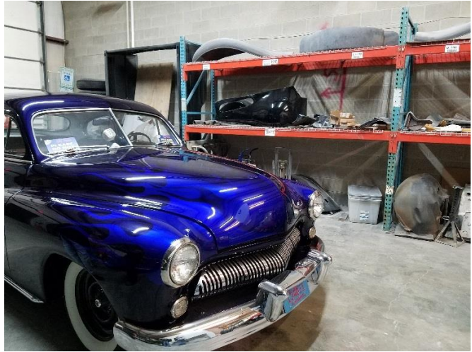
MIDNIGHT HOTRODS OPEN HOUSE