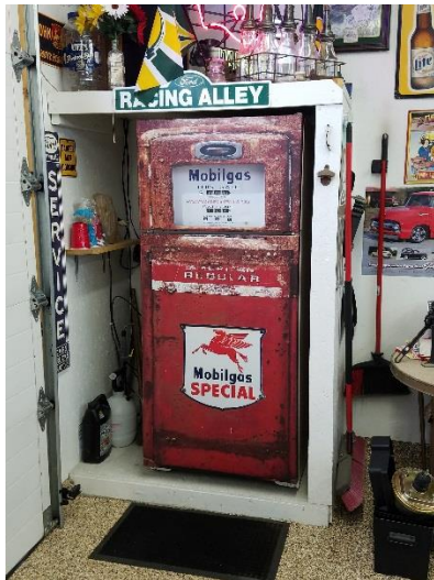
Cool Gas Pump Wrap on the Garage Fridge!