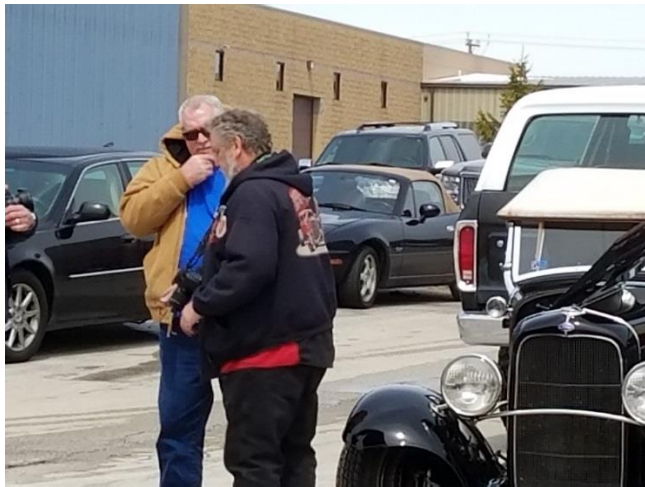
Hmmm..... Wonder what these conversations were about??