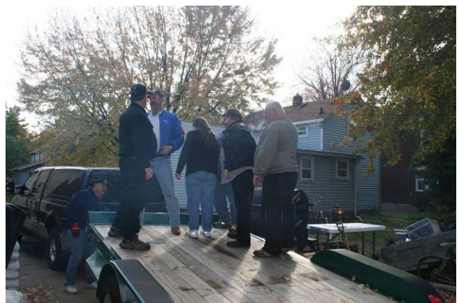
Everyone wanted to ride on the trailer.