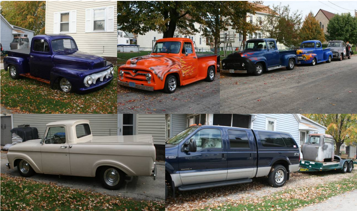
All the trucks attending the October meeting.