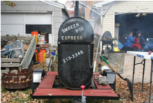
The Smoken Pig Express used by Chef Linskens.