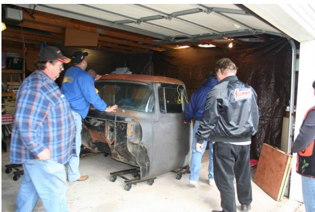
The trucks' new resting spot.