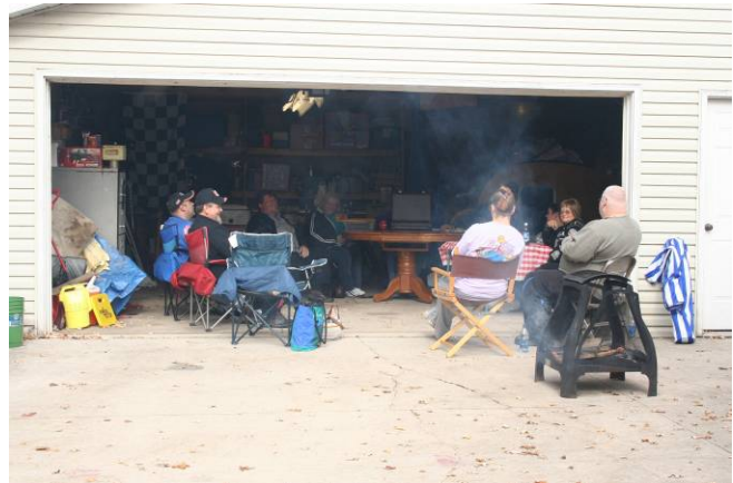
Meeting in the garage before the savory meal.