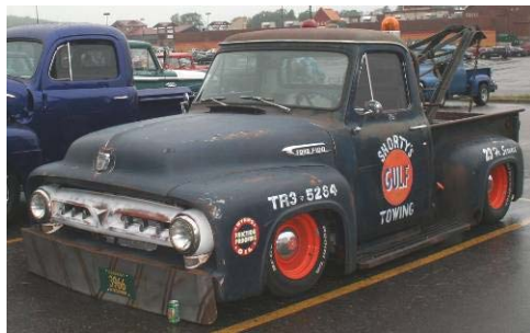
The tow truck David proudly drove to Dash 19.