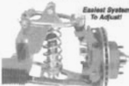
Easiest System To Adjust!

You get the trick look of polished A-arms and eliminate the need for strut rods. Compare this package with brands which cost hundreds more. Proven quality now made better. Still just $1695!