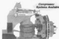
Compressor Systems Available

Fat man Air Ride IFS features our new polished stainless A-arms and genuine AirRide Technologies components. Shocks included. There's NO better air ride deal at $1995 hub-to-hub!