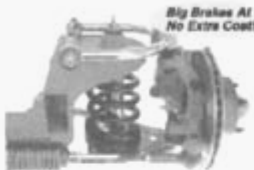
Big Brakes At No Extra Cost!

You get the trick look of polished A-arms and eliminate the need for strut rods. Compare this package with brands which cost hundreds more. Proven quality now made better. Still just $1695!