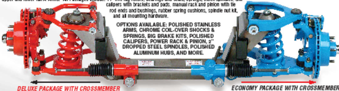
DELUXE PACKAGE WITH CROSSMEMBER