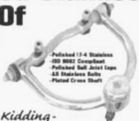
-Polished 17-4 Stainless -ISO 9002 Certified -Polished Ball Joint Caps -All Stainless Bolts -Plated Cross Shaft