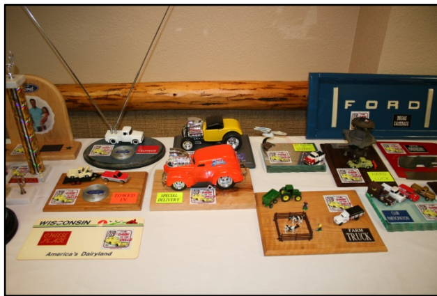
Club members made trophies, trophies, trophies.