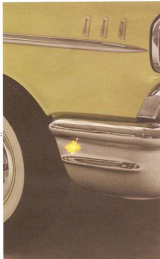
1/2" 36-41 Chevy