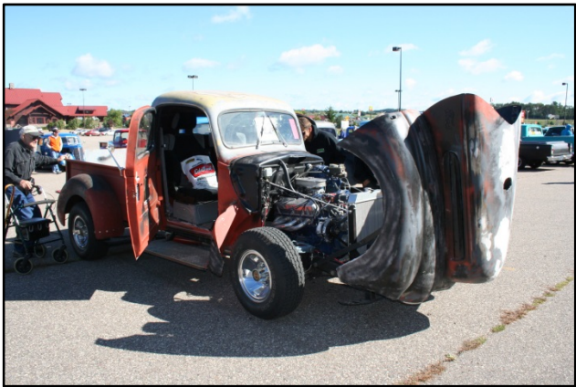
Chuck & Marlene Rogers' cool 1946 Ford truck.