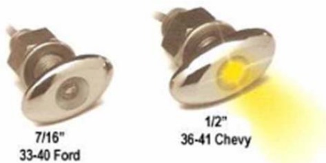
7/16" 33-40 Ford