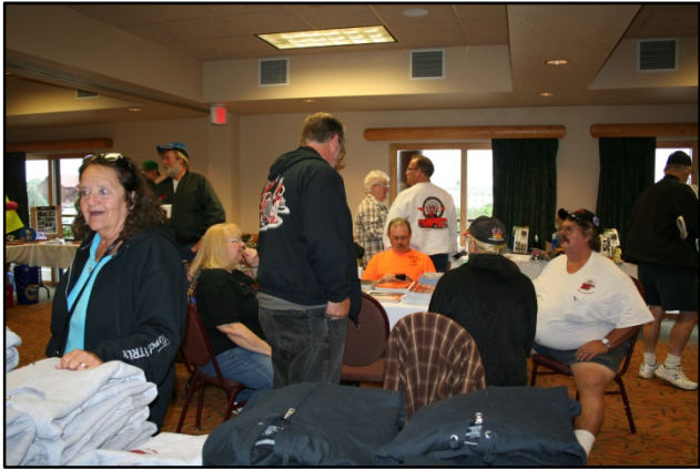
Friday morning registration.